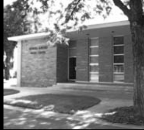
Burford Music Hall