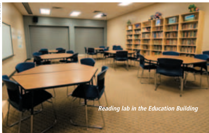
Reading lab in the Education Building

"The building, like the new college, provides a fresh start," Breeding said. "It is equipped with the most updated technology. It provides much-needed additional classroom space and a welcoming environment that invites everyone to learn."▲