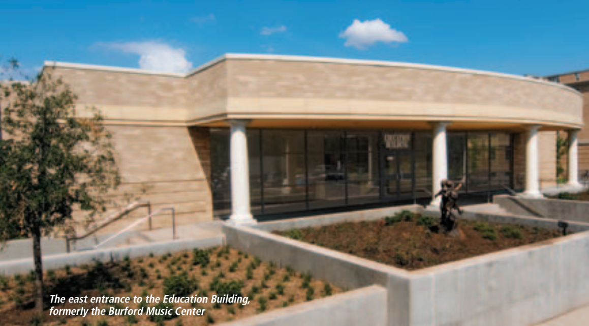
The east entrance to the Education Building, formerly the Burford Music Center